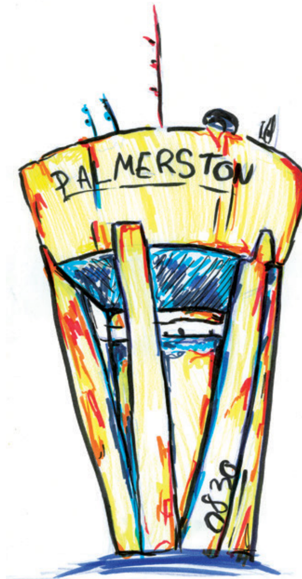
Artwork from Palmerston Postcard Project 2020