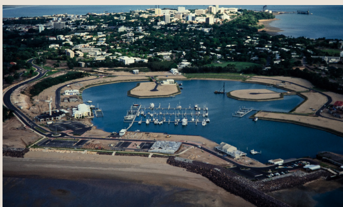
Colour slide aerial view of Darwin [showing Cullen Bay]

14 December – Kakadu National Park, encompassing stage 3 which includes Coronation Hill, is listed as a World Heritage Area.