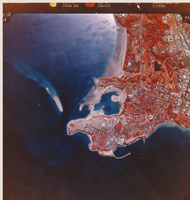
Infrared aerial photograph of Cullen bay.

7 May – Space Shuttle Endeavour makes its maiden flight, as a replacement for Space Shuttle Challenger which was destroyed after take-off on its tenth flight in 1986.