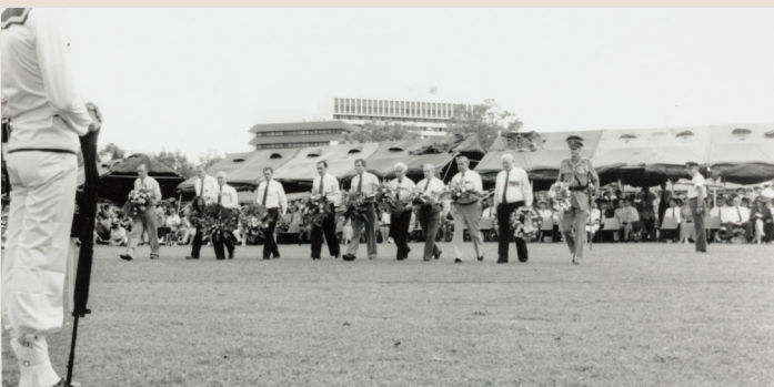
Wreath laying at the Fiftieth Anniversary of the Bombing of Darwin commemoration service

13 March – NT News reports that the last of the pastoral stations owned by Vestey's in the Northern Territory have been sold, ending the Vestey Cattle empire's long and controversial association with the Northern Territory.