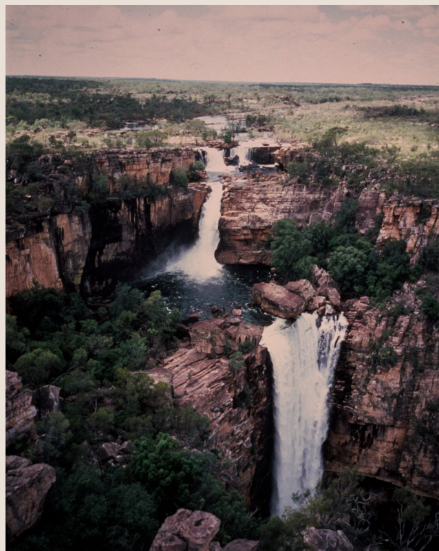
Kakadu National Park