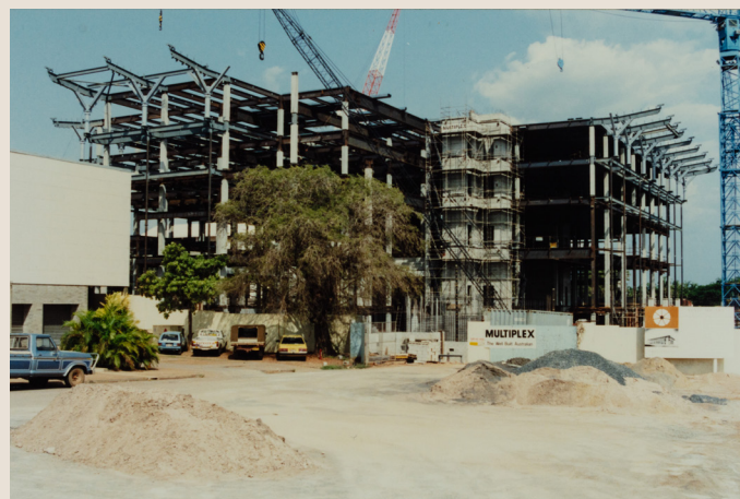
Construction of Parliament House, Darwin.

27 September – Brisbane Broncos (28) defeat St. George Dragons (8) to win the 85th New South Wales Rugby League