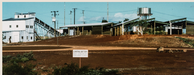
No. 3 Government Battery, Tennant Creek, ca 1980

The 92 hectare site is of historical interest with potential as a mining museum. The schedule of work and waste containment costs associated with the environmental rehabilitation of areas covered by tailings, is attached to the Submission. Government approved $50,000 toward the costs of rehabilitating the site, and for the site to be transferred to the community. Legal transfer of the title could not be affected until the Warramungu Land Claim was finalised.