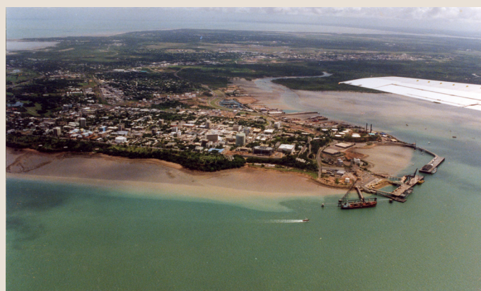
Aerial view of Darwin Wharf to the right of the photo. Also shows Parliament House under construction.

The Plan will bring about the integration of resources from government and non-government sectors for the prevention and control of land degradation. The Northern Territory Decade of Landcare Plan is attached to this record.